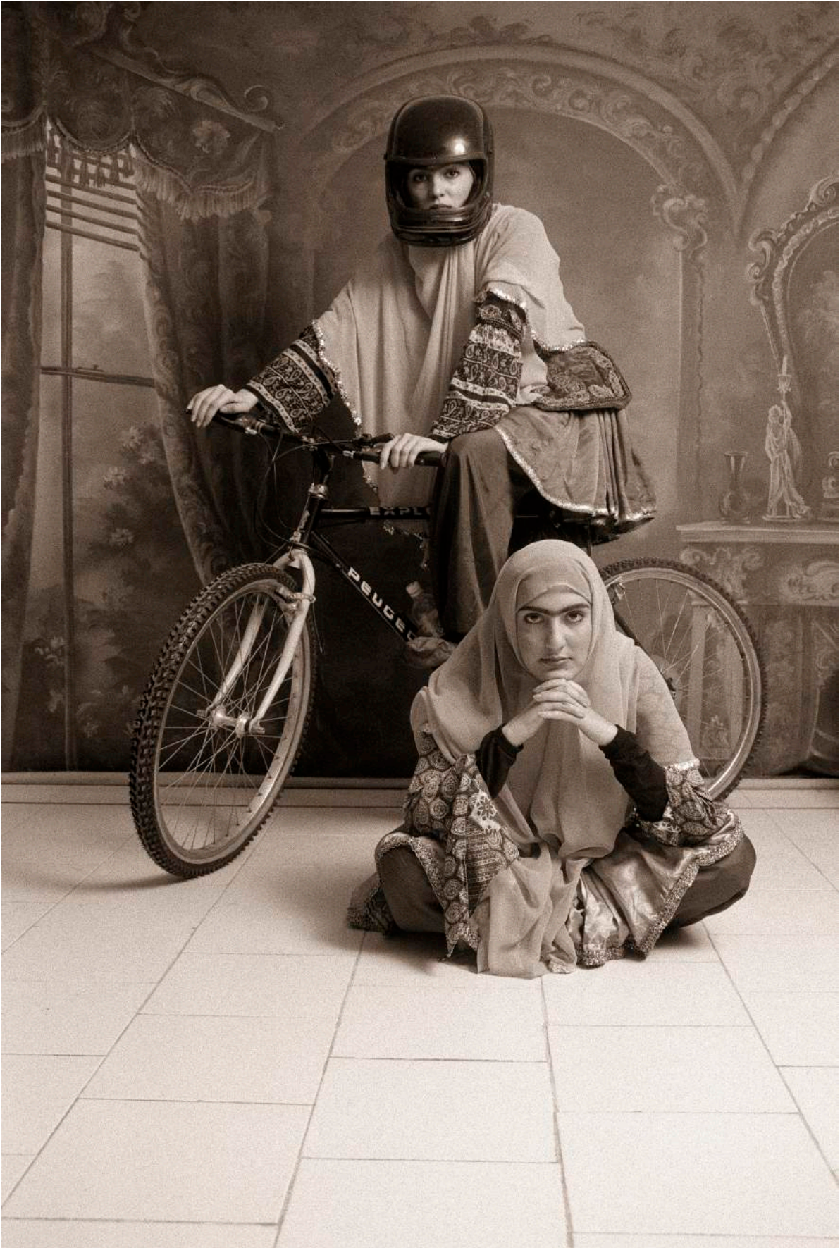
SHADI GHADIRIAN (IRAN, YEAR 38 EXHIBITION) QAJAR, 1998.