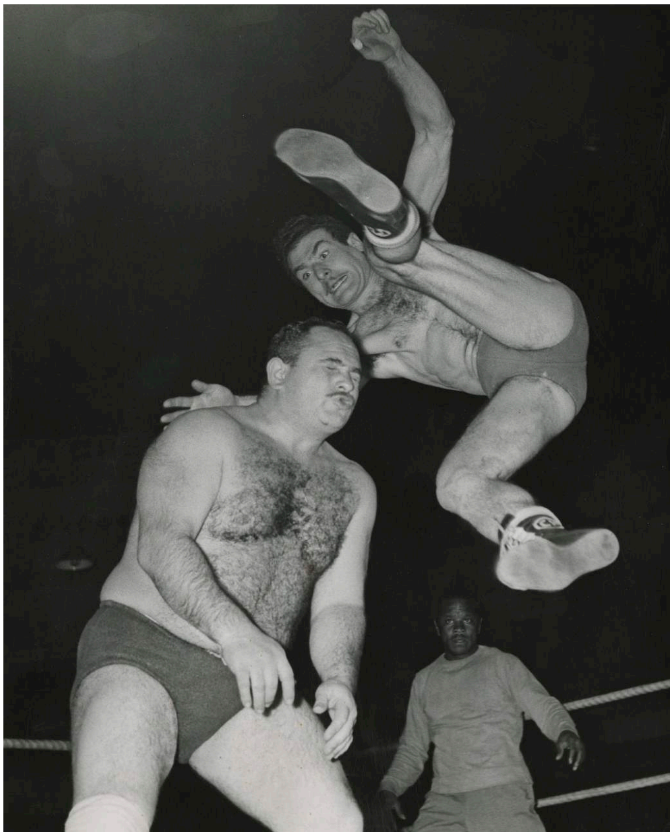
TWO WRESTLERS, BOGOTA, 1956. SILVER PRIN (THE COW AND THE ORCHID EXHIBITION).