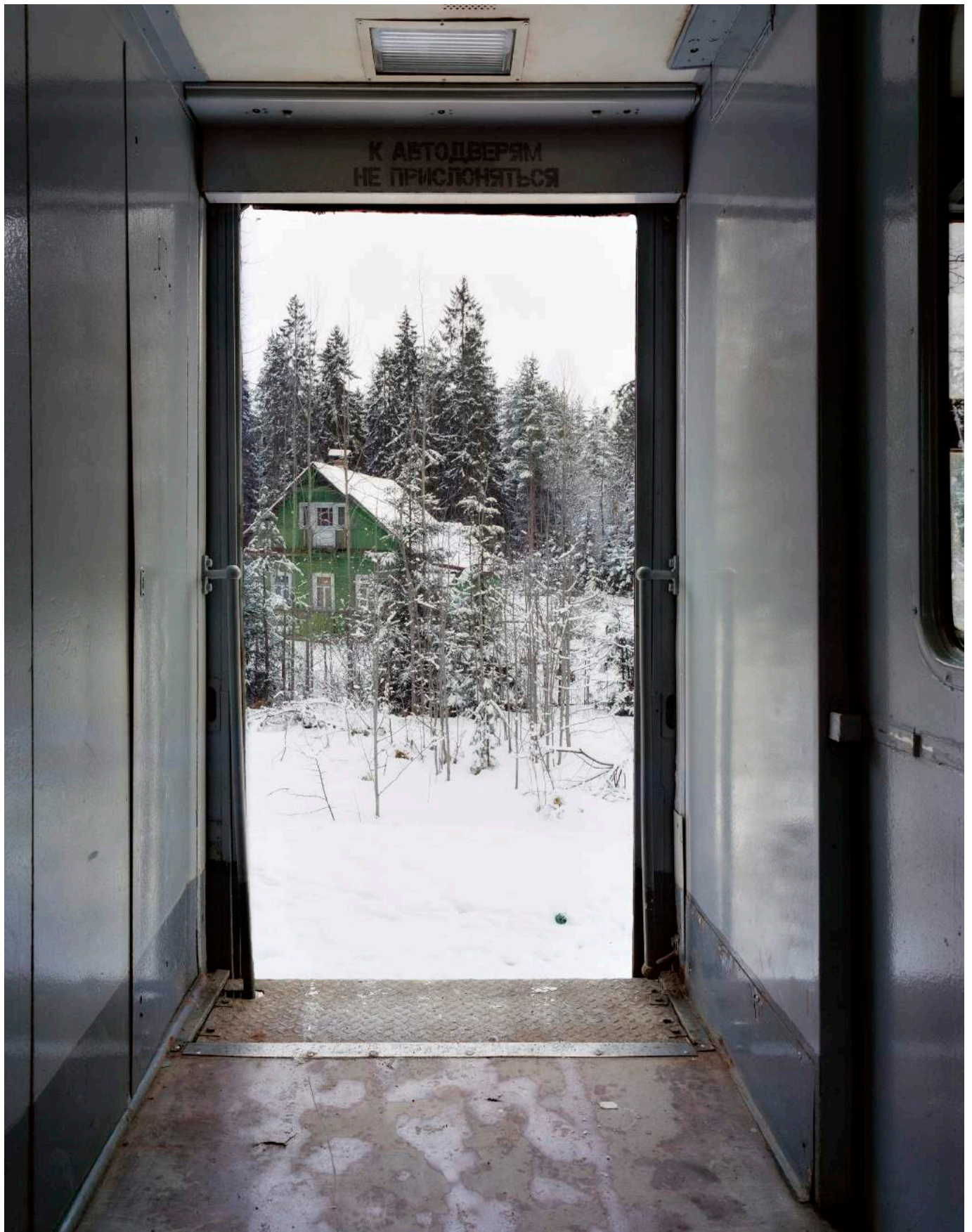
MARIE BOVO СТАНСЫ - ПЕТЯРЬВ (STANCE - PETIAJARVI), 2017.