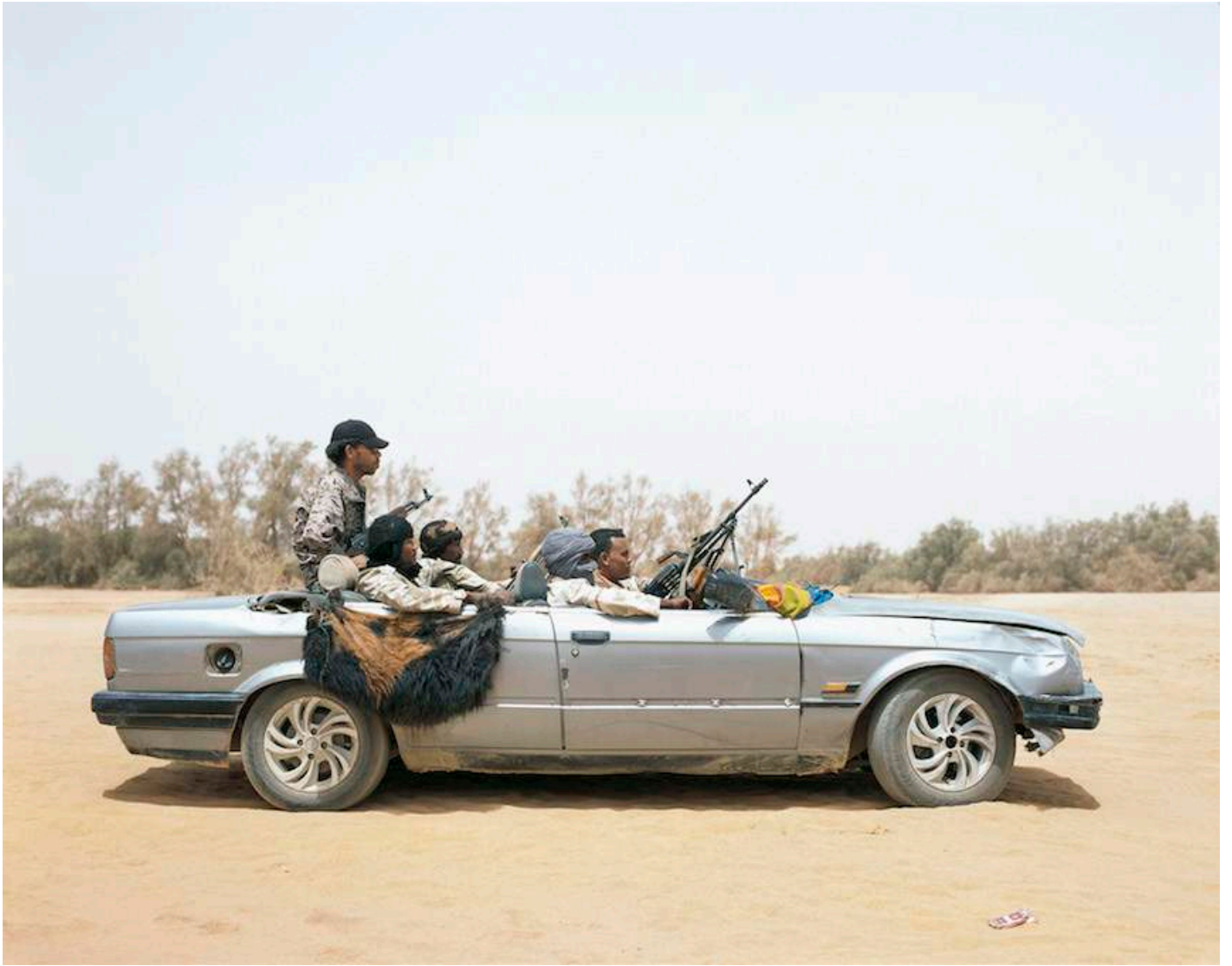
PHILIPPE DUDOÛT UBARI, SOUTHERN LIBYA, JUNE 2015. LIBYAN TUAREG TRIBAL MILITIA GROUP VÉHICULE.