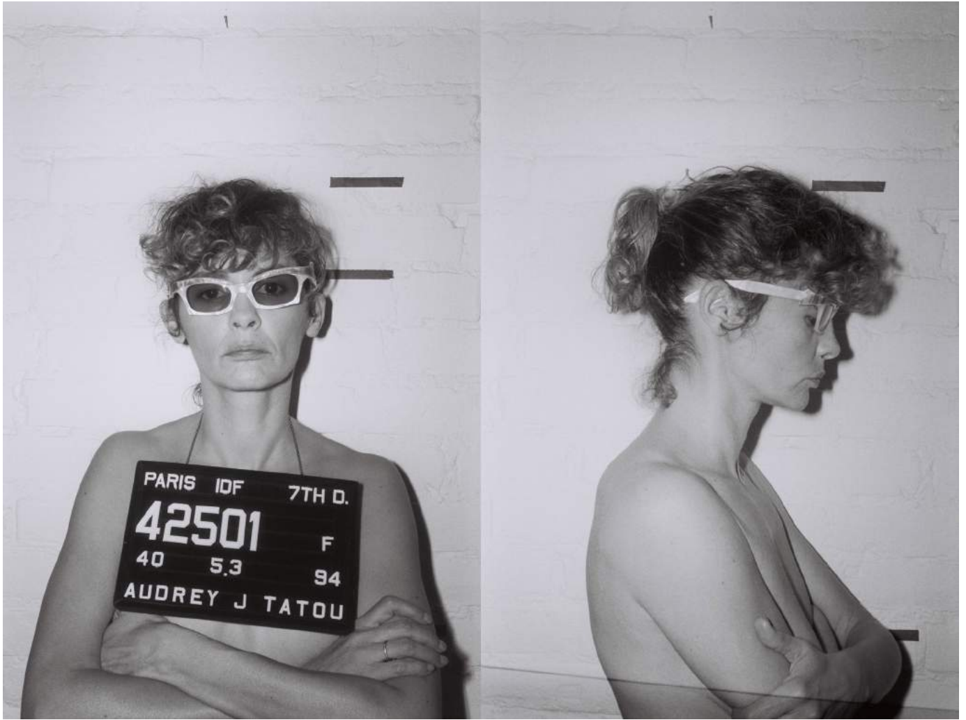
AUDREY TAUOU UNTITLED. COURTESY OF THE ARTIST.