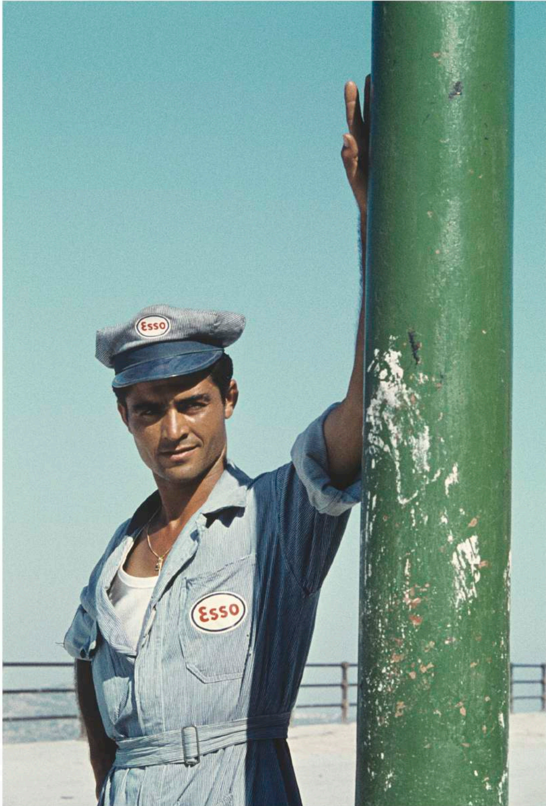
THE PHOTOGRAPH FEATURED ON THE 2016 POSTER WAS SHOT BY KARLHEINZ WEINBERGER, COURTESY OF ESTHER WOERDEHOFF.