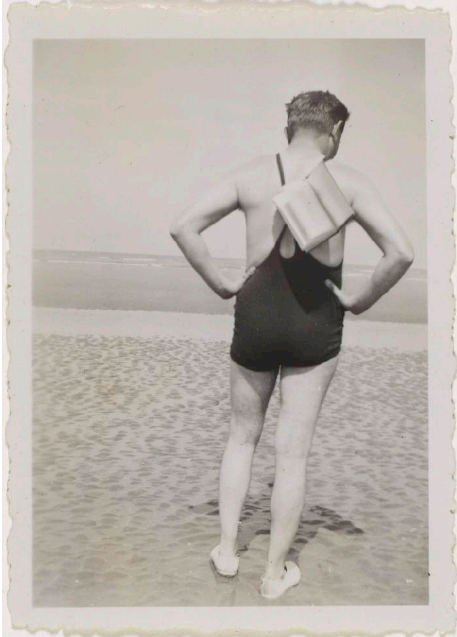
RENÉ MAGRITTE (THE SPECTRE OF SURREALISM EXHIBITION) L'ÉMINENCE GRISE, 1938. COURTESY OF ADAGP, PARIS.