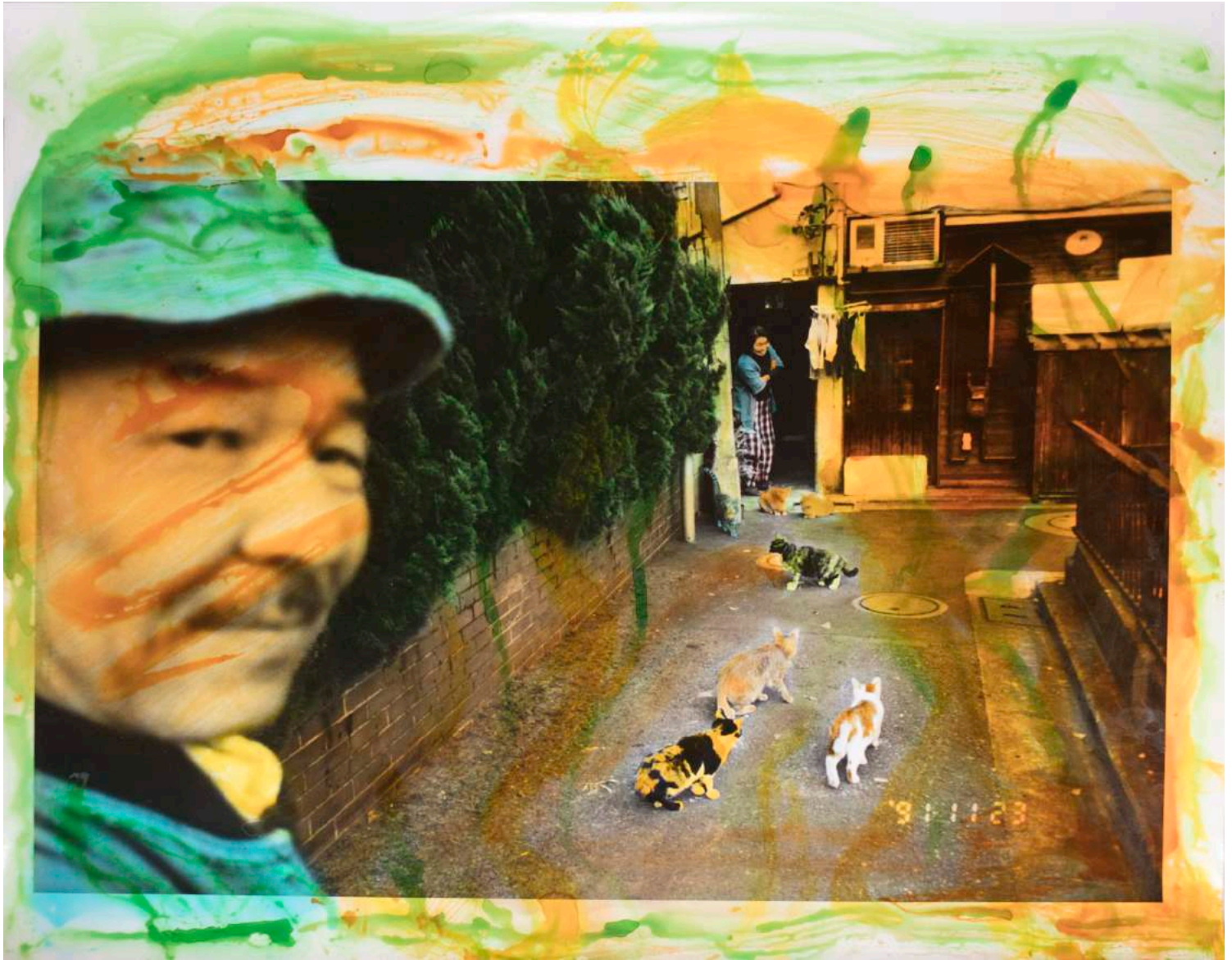
MASAHISA FUKASE PRIVATE SCENES, 1991.