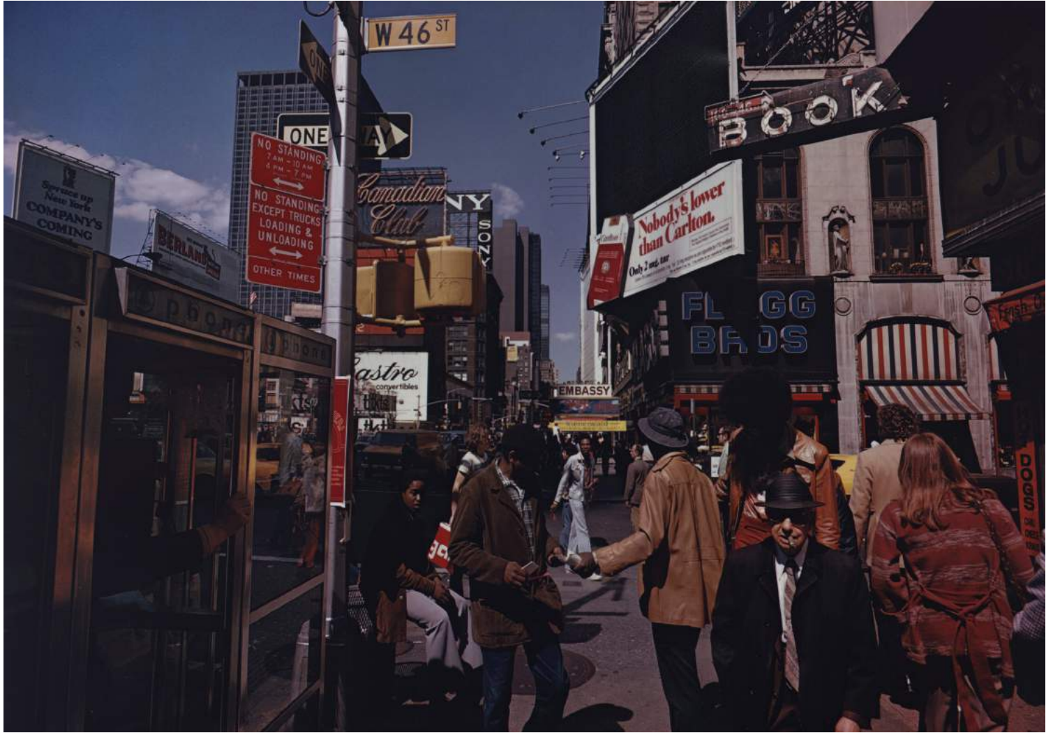
JOEL MEYEROWITZ BROADWAY AND 46TH STREET, NEW YORK CITY, 1976.