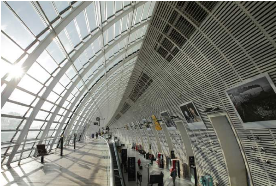
In 2016, the Rencontres d'Arles were the XXL guests of the Avignon TGV train station.